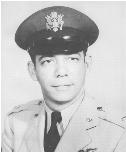
Lt Col Mortimer A. Yates, #1952