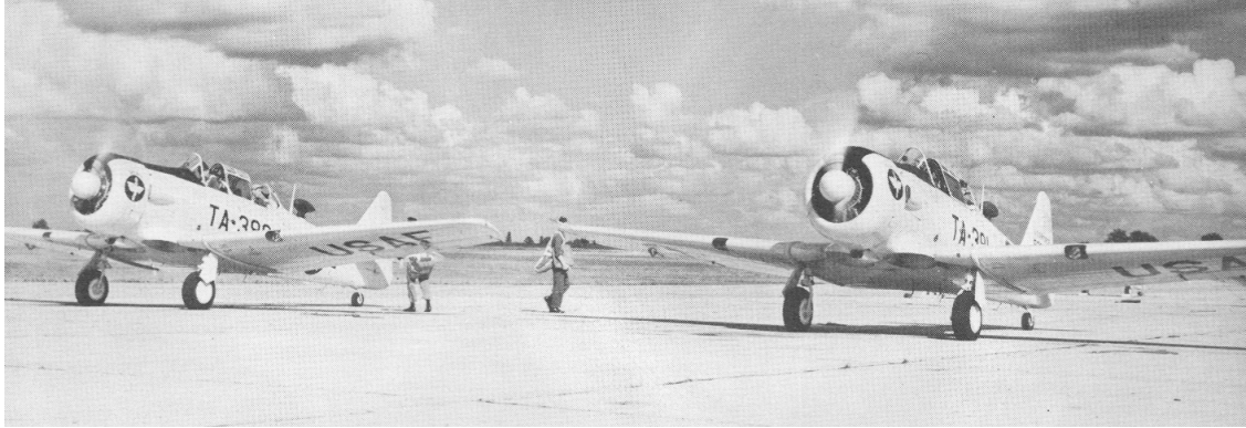
3302 Training Squadron (Contract Flying) T-6Gs at Spence Field.