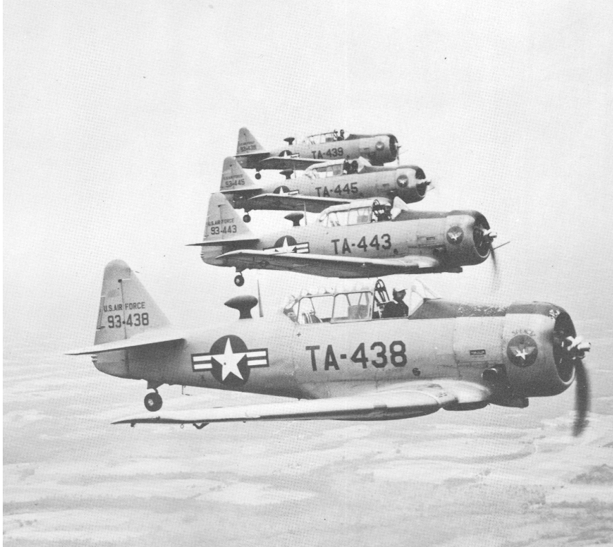
3302 Training Squadron (Contract Flying) T-6Gs in formation.