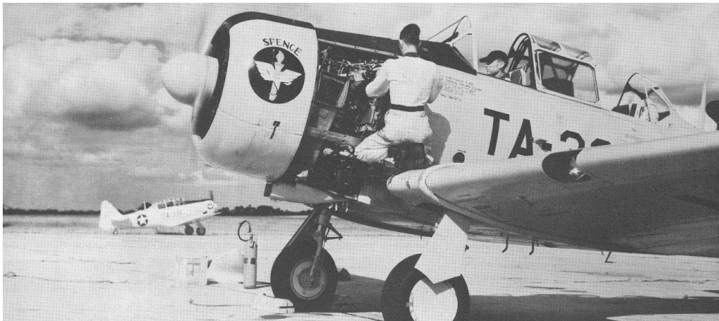
T-6G maintenance at Spence Field.

USAF Unit Histories Created: 20 Sep 2021 Updated: