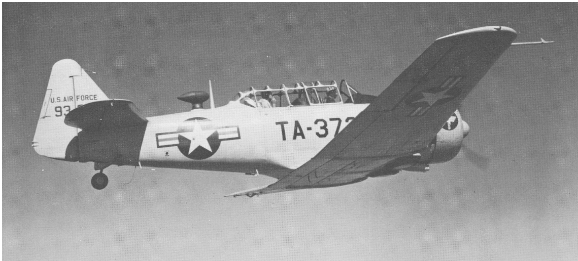
3302 Training Squadron (Contract Flying) T-6G in flight over Spence Field.